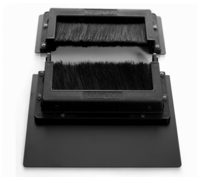
Surface L Raised Floor Grommet Item No. 2030