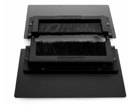
Surface XL Raised Floor Grommet Item No. 2040