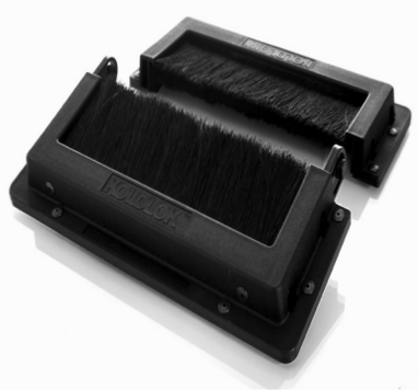
Surface Mount Raised Floor Grommet Item No. 2020